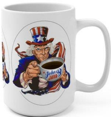
John B Java Coffee Mug