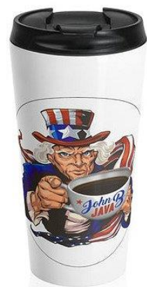
John B Java Stainless Steel Travel Mug