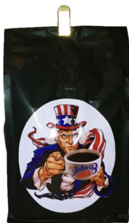
John B Java Whole Bean